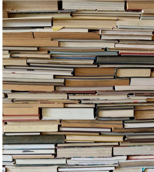
Figure 14. Screenshot of the Typeform ending A.